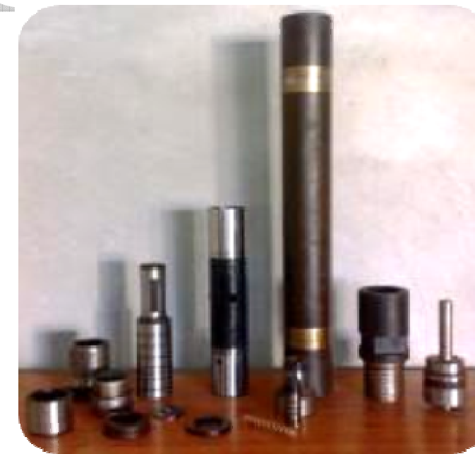
PARTS OF KGR DTH HAMMER

Equivalent Shank Type: PANTHER, DHD-340, COP-42.