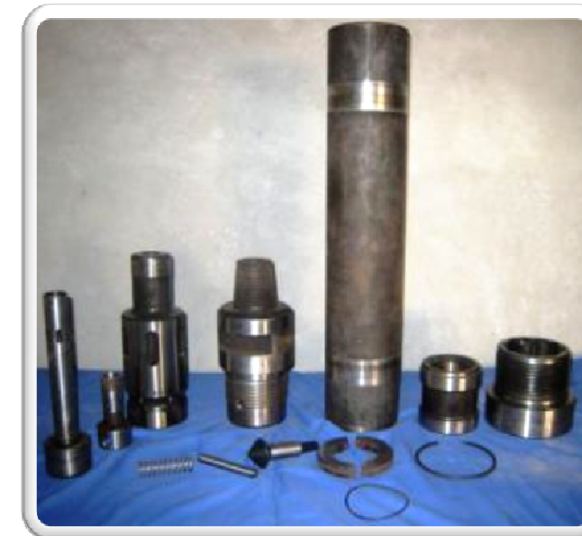
PARTS OF KGR DTH HAMMER

NOTE: As per the customer's specifications we manufacture all type of DTH Hammers & Button Bits.